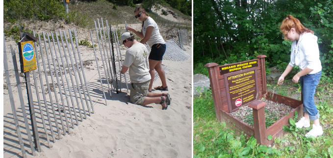
(Left) Eastern Lake Ontario Dune Stewards repair protective dune fencing; (right) Salmon River Stewards encourage public use of NYSDEC invasive species disposal stations.

In 2009, New York Sea Grant created the Eastern Lake Ontario Dune and Salmon River Stewardship blog to reach new audiences. The Eastern Lake Ontario Dune and Salmon River Stewards posted content weekly. Postings included information about the stewards' educational, habitat restoration, and conservation efforts paired with vibrant photos.