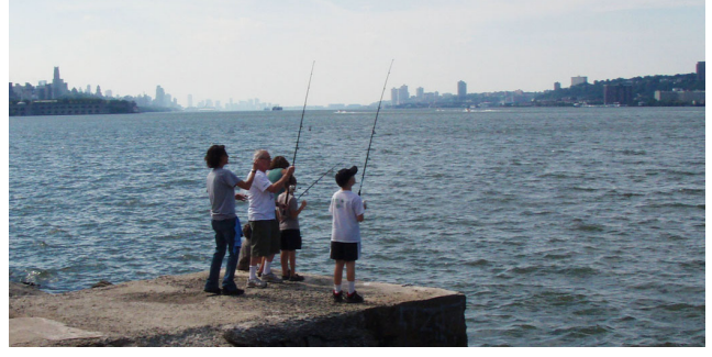
An I FISH NY staff member helps four New Yorkers try their angling luck in the Hudson River during the Little Red Lighthouse Festival, September 25, 2010.

Showing off a brown bullhead catfish at the 2010 Fall Family Fishing Festival, Hempstead Lake State Park.