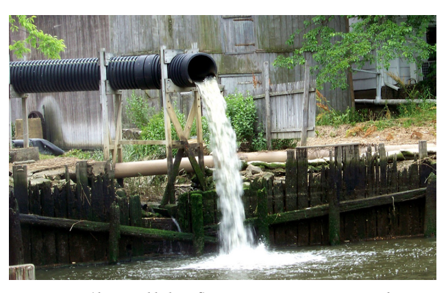
Above and below: Stormwater contaminants pose threats to public health and wildlife.