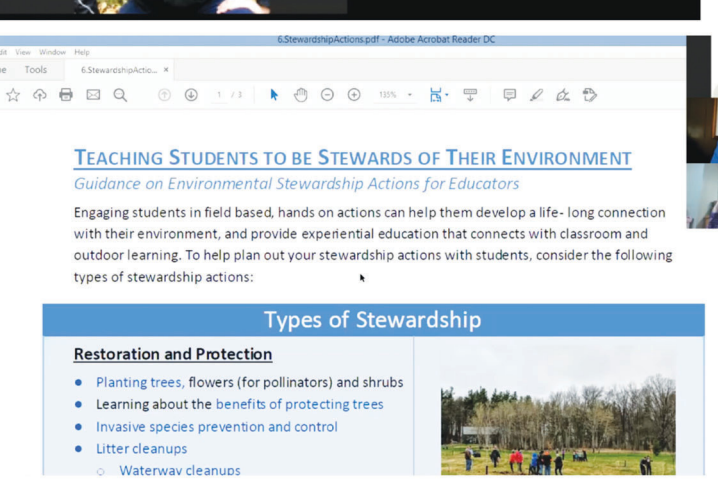
A team of NYSG educators created a virtual professional development training opportunity for K-12 educators.

Niagara Falls, Oswego, Rochester, and Syracuse. These educators reach more than 2,745 students with classes and programs. One hundred percent of the workshop participants reported increasing their knowledge on stewardship projects; 86% reported they were likely to implement a stewardship project that would include a remote/distance-learning option. Some concerns were expressed related to the pandemic and having less in-person time with students. Eighty percent of the participants wanted another workshop to explore ways to engage students remotely as a group.