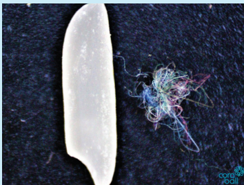
Microfibers next to grain of rice.