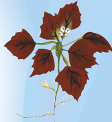
Water Chestnut ( Tropha natans )