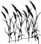
Common Reed ( Phragmites australis* )

*Although native, Phragmites is expanding its range and displacing other native species.