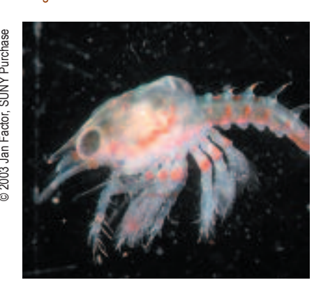
Stage I larva, the first of three larval stages that live in the plankton, near the surface.